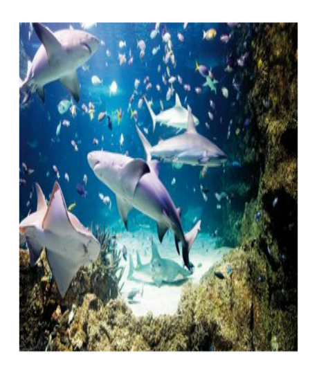
Reminder that P-2 Excursion to the Sydney Aquarium is on Tuesday the 11th of September 2018. Please bring back your note and money As soon as possible to the office . The last day any money will be accepted is the 10th of September 2018.